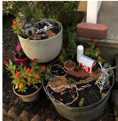
Gracie Bucher, Container Garden