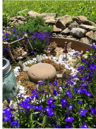
Eva Commisso, Container garden