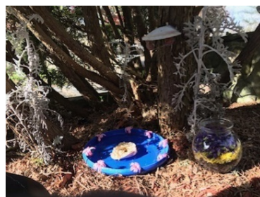
Maciek Wacławski, Container Garden