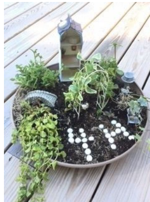
Kathryn Zurovchak, Container Garden