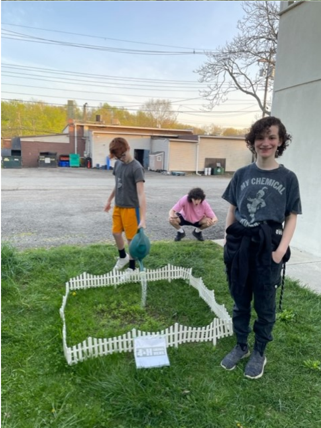
The kids had a great time digging, weeding, planting wildflowers and just being outside