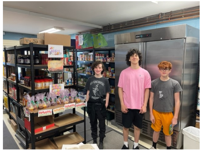
Out Of Our Shells April food pantry night. The members did a great job stocking shelves and decorating the 4H table. Homemade cookies and cake were made for all the patrons.